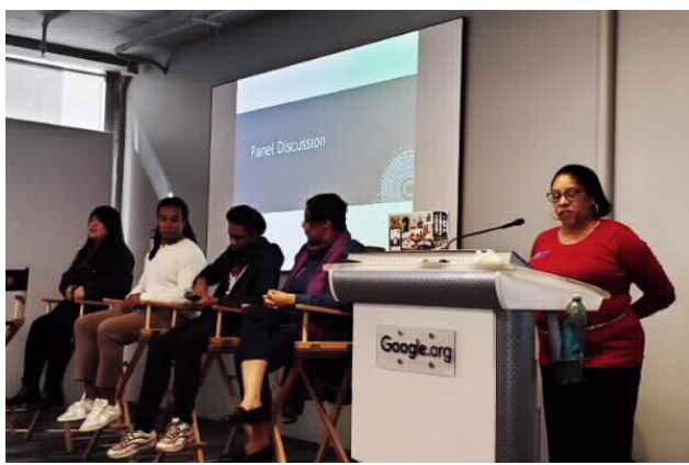
Panel discussion with community leaders and member of the TAY workforce in San Francisco

Last month, the Behavioral Health Services, Transitional Aged Youth (TAY) System of Care (SOC) co-hosted Exhale – Self-Care and Wellness . The two-and-a-half-hour event for TAY providers focused on managing the stress and strains of supporting youth during the holiday season.